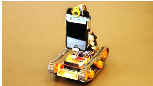
Fig. 1. Tippy the telepresencce robot.

With increasingly powerful mobile devices, a significant amount of processing power is available to portable interactive applications. Numerous existing consumer level accessories such as keyboards, speakers, headsets and other add-ons extend the functionality of devices by providing extra interfaces. However, there is considerable development overhead when trying to interface mobile devices with new hardware. This paper presents Tippy (Fig. 1), a telepresence robot as an example application, which requires a hardware interface between mobile device and custom circuitry and describes the process of implementing a simple optically coupled interface to achieve this.